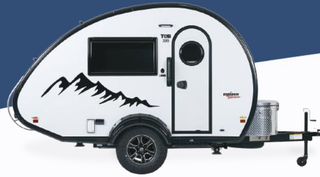
TAB 320 BLACK CANYON PACKAGE SHOWN