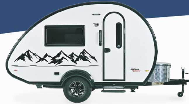
TAB 360 BLACK CANYON PACKAGE SHOWN