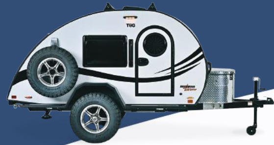
TAG XL BLACK CANYON PACKAGE SHOWN