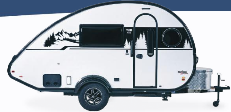
TAB 400 (Without Bunk) BLACK CANYON PACKAGE SHOWN